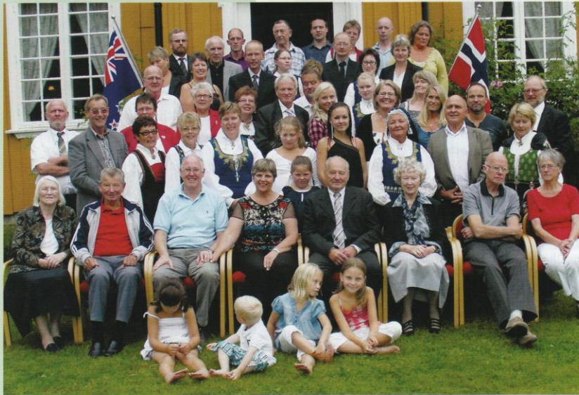
218 — NZSG September/October 2010