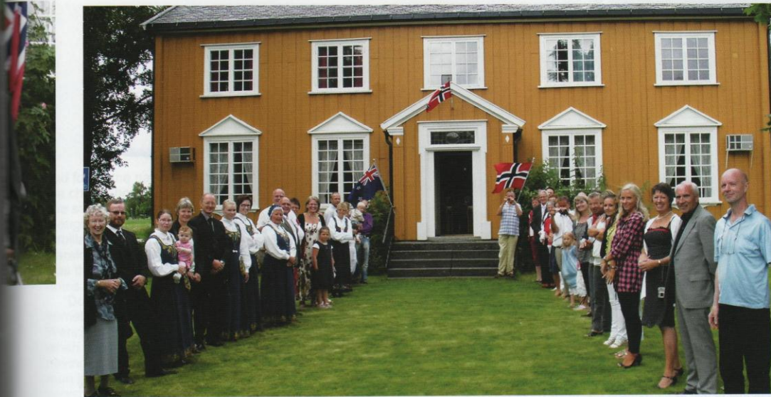
The grand welcome.

after him and coming to get him". At the time this was passed off as delirium, but we wonder now if he was haunted by his hidden secret for all his life.